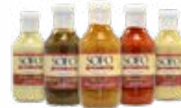
Sof Imperial Brand Salad Dressing