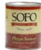
Sof Imperial Brand Pizza Sauce