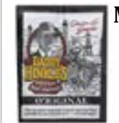
Daddy Hinkles Meat Marinade