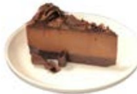
Chocolate Indulgence Cake Slice