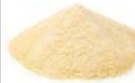
Bulk Semolina Flour