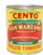
Cento San Marzano Tomatoes