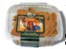
Oasis Pita Chips