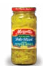
Mezetta Pepper Rings