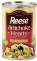
Reese Marinated Artichoke Hearts 14 oz