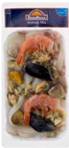
Panapesca Seafood Medley 16 oz