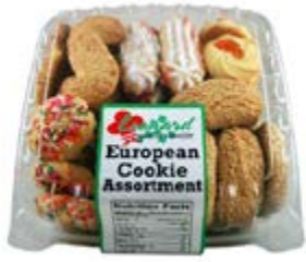
Leonard's Cookies Varieties - 16 oz

Go online to learn more or scan the QR. →