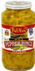
Bellview Peppers & Pepperoncini Varieties - 32 oz