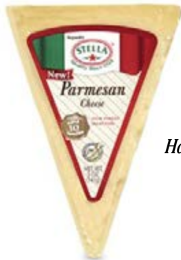
Stella Parmesan Handcut or Grated

Save with the Stromboli of the month! $8.99 /ea.