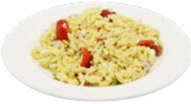
Sof's Own Orzo Salad