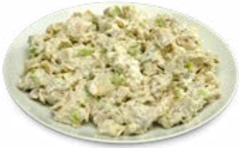
Sof's Own Chicken Salad