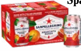
San Pellegrino Sparkling Drink Varieties - 6 pk