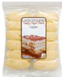
Simply Elegant Desserts Soft Ladyfingers 3 oz