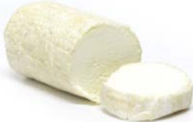
Sof's Fresh Goat Cheese