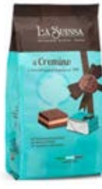
La Suissa il Cremino Chocolates Varieties - 4 oz