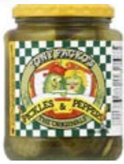
Tony Packo's Pickles & Peppers Originals or Sweet Hots Varieties - 24 oz