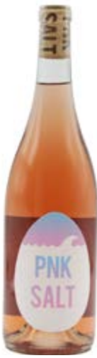
Pink Salt Rose

A dry rose with incredible cherry red aromats. Sourced from certified organic Cabernet Sauvignon, they take the free run juice to achieve the perfect pink color, and allow native fermentation to amplify the candy red aromas. At just 12.5%, the wine is light on the palate, with a salty finish.