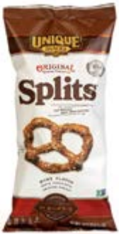
Unique Brand Pretzels Varieties - 10 oz