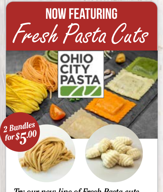
Try our new line of Fresh Pasta cuts, featured in our Salad Bar and Ravioli or Gnocchi found in the freezer section.